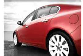
Automotive & Power